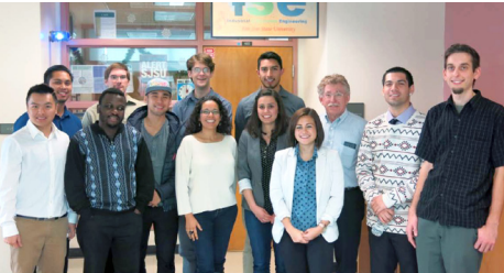
IWM staff collaborates with staff and students from the SJSU ISE projects.

E SD STAFF MEMBERS are expanding their leadership abilities and sharing their passion for the environment with the university community. In December 2014, staff from the Integrated Waste Management (IWM) and Watershed divisions attended final student presentations for San José State University's Industrial & Systems Engineering (ISE) Senior Design Projects. The presentations were the culmination